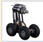
P494 Pan and Rotate Camera Crawler